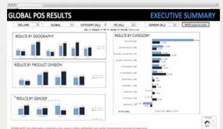
For Business Planners