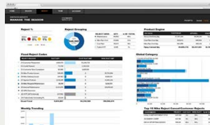
For Customer Service Reps